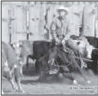
$3,000 Novice Champion Little Dirty Dancer